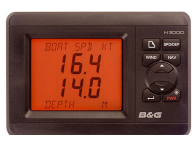
H3000 Software Updates