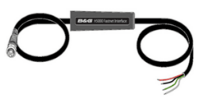
H5000 Fastnet interface The H5000 Fastnet Interface provides a B&G supported solution for customers wishing to progressively upgrade H3000 systems and/or replace displays on an H3000 system with the latest H5000 Graphic displays.