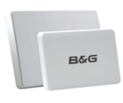
H3000 Sun Cover (GFD, GPD, 20/20 HV) H3000 Sun Cover (GFD, GPD, 20/20HV)