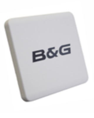
H5000/H3000 Sun Cover (Analogue) H5000/H3000 Sun Cover (Analogue)