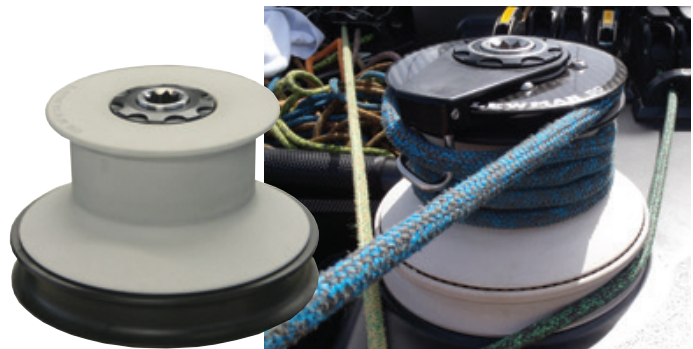
Grand Prix Racing Winch Specifications